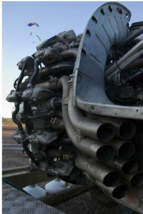
The Pratt & Whitney patiently waits for it's cue.