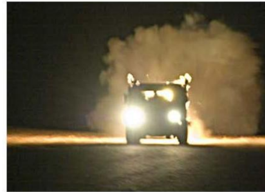
MAD'S mighty blitz. Flaming exhaust stacks are beaut for inspecting the powerplant after the run.