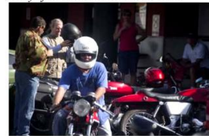
Some wanted to talk, others would rather ride!