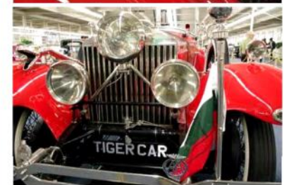
1925 Rolls-Royce Phantom I Barker Torpedo Tourer