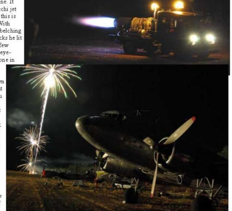
And there were fireworks too!!

normal run of the mill SWB Blitz with a set of chrome car wheels, but bolted on the tray is a whopping Rolls Royce Viper jet engine. It used to live in a Macchi jet aircraft. (Remember this is an aviation night) With flames permanently belching from the exhaust stacks he lit up the afterburner a few times to singe a few eyebrows and get everyone in the right mood then released the brakes and disappeared down the airstrip. With that afterburner lit up you always knew where he was. Quite a sight in the pitch black bush. Dropping back to an idle (jets idle?) he chucked a U turn and blasted off back towards us. It sure kept you warm on a cool night.