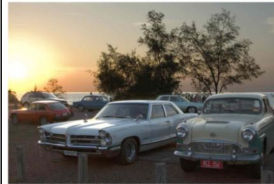
All kids of cars roll up to these shows. Darwin sure is a good place for sunsets.

It seems we used to spend a lot of time down the beach at sunset. Hard life!