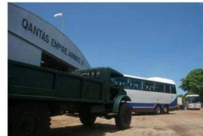
How many coaches do you reckon you can fit in the yard ?

Darwin City Council. All weekend they ferried vets from one venue to the next, leaving some who found the venue interesting and needing a bit more time to digest, to hop on the next bus. One organisation that was well