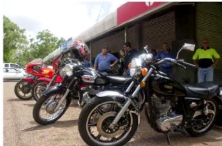
On the way home at Batchelor

There was one of just about every brand but Triumph was the most popular marque on this day