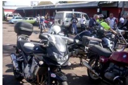
Plenty of modern bikes here at the start.

Midway stop at Batchelor store. 18 bikes in the photo. Some didn't stop at Batchelor, about 20 in all. Not bad for the first bike event.